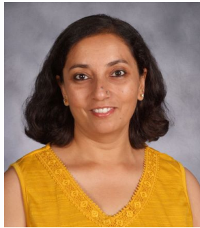
Pragati Bansal Healthcare Solutions